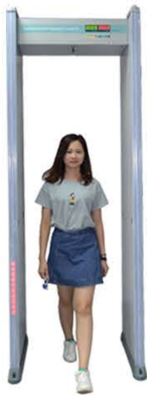
LTLED6 6 zones, 12 zones and 18 zones,have the same apperance, LED digital display