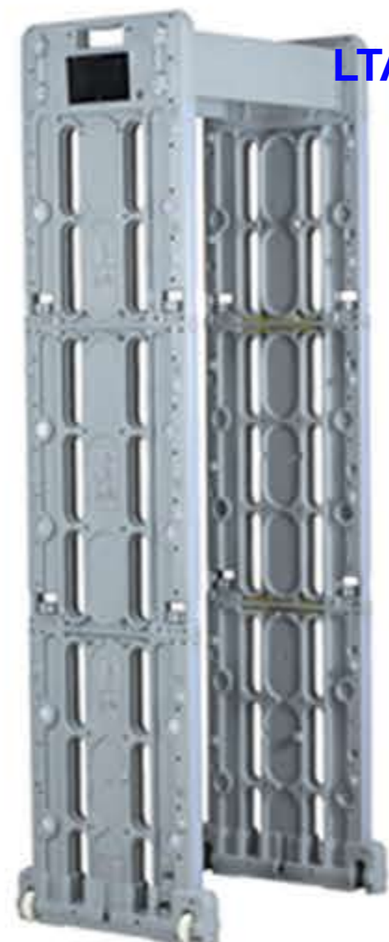
LTAPLCD24 24 Zones, Portable 7 inch LCD Touch Screen,IP65 Optional function: wifi APP for android phone, waterproof cover Part of sensitivity): 255 Whole Security level: 100 Application: 90 places Detect flying objects Frequency: 100(Automatic or Manual) Alarm: 16 kinds of Sound Black/grey shell