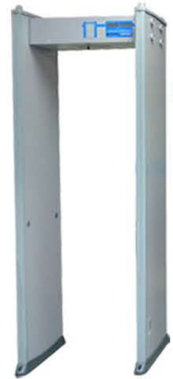
LTLED4 4 Zones, LED digital display