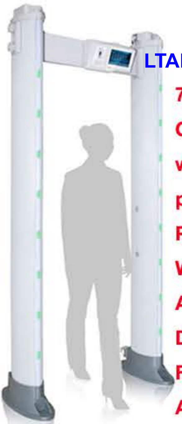
LTALCD24 24 Zones, 7 inch LCD Touch Screen,IP65 Optional function: wifi APP for android phone, waterproof cover Part of sensitivity): 255 Whole Security level: 100 Application: 90 places Detect flying objects Frequency: 100(Automatic or Manual) Alarm: 16 kinds of Sound